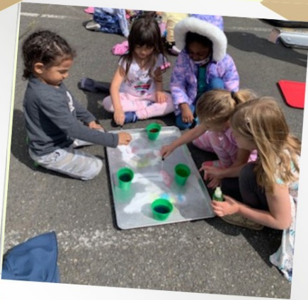
Outside Science Experiment