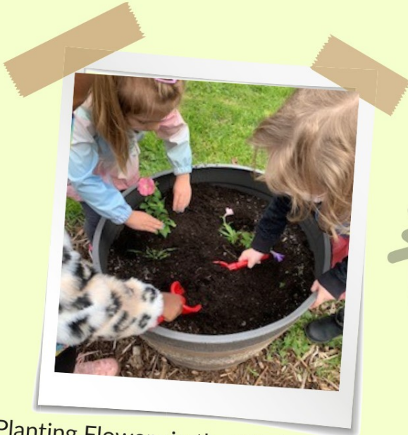
Planting Flowers in the Pilgrim Patch

We are so excited to be starting another school year of preschool. Our students will be starting on Sept 12th and we can't wait to have everyone here. We have been planning for the school year and have a lot of fun, hands on learning activities and crafts. We have 2 new teachers joining us this year and it is going to be amazing. Thank you for all of your continued support for Little Pilgrims Preschool and our mission.