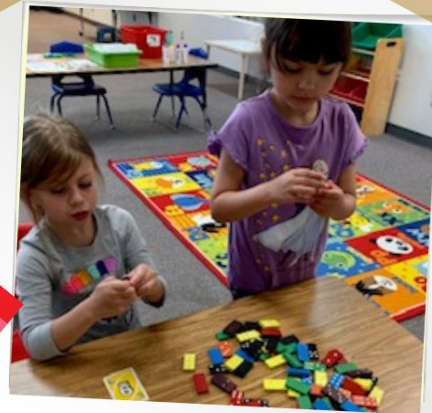
Learning Numbers the Fun Way!